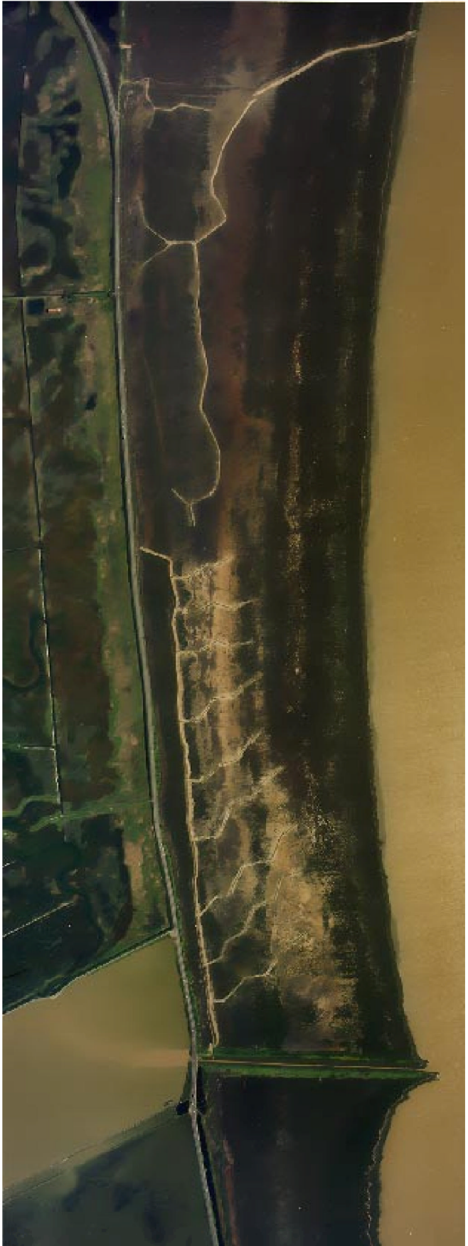
Fig. 1. Aerial view of San Pablo Bay marsh restoration project. The photo longitudinal axis is oriented east-west with the Bay to the right (south).