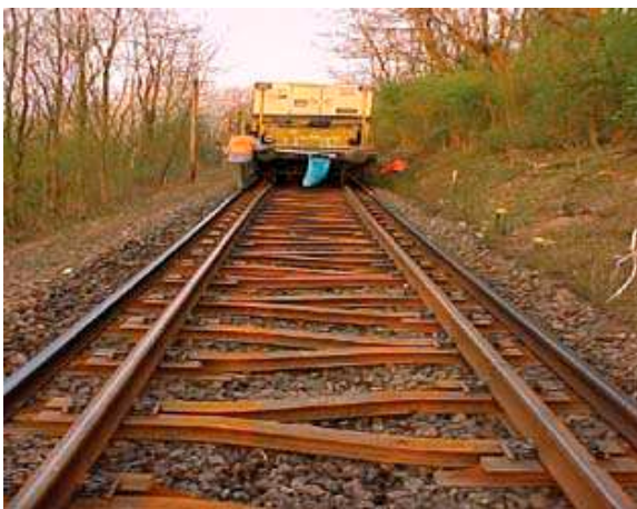
Fig. 2. Y-Steel-Sleeper

lateral resistance for securing its geometry are among other technical advantages presented by steel sleeper. Additionally, damaged sleepers also have commercial value (Esveld, 2001), since the steel can be recycled several times and reused in the railway industry. In the search for further improving the characteristics of steel sleepers, the traditional orthogonal sleepers have been replaced by Y-steel-sleepers ( Figure 2 ). The development of this new model provided a further reduction in weight of steel sleepers and gain of resistance against cross movements due to the amount of accumulated ballast in its central part as a consequence of its design similar to the letter Y (European Federation of Railway Trackwork Contractors, 2007; Tata Steel, 2014).