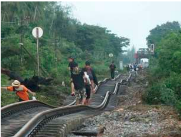
Fig. 4. Track condition after a flash flood in 2016.

Railway track structure and substructure are expected to resist the static and dynamic loads that are generated by the passage of moving trains. Additionally, the cyclic characteristic of these loads has a great influence on the track long-term behaviour. Without appropriate design, construction, inspection and maintenance of track components, track stability can be undermined and the georisks can be increased (Osman et al., 2017), as shown in Fig 4.